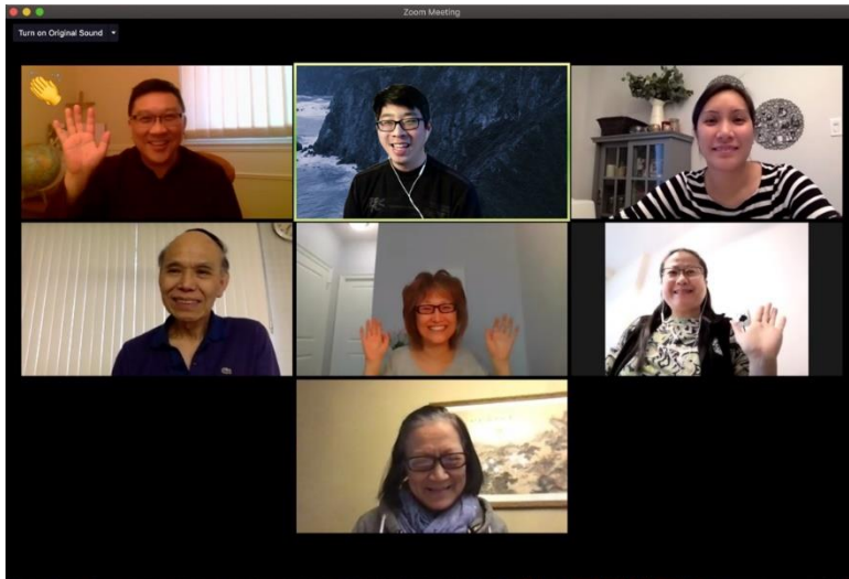
Family Zone Cell Leaders & Pastors 家庭區小組組長及牧者