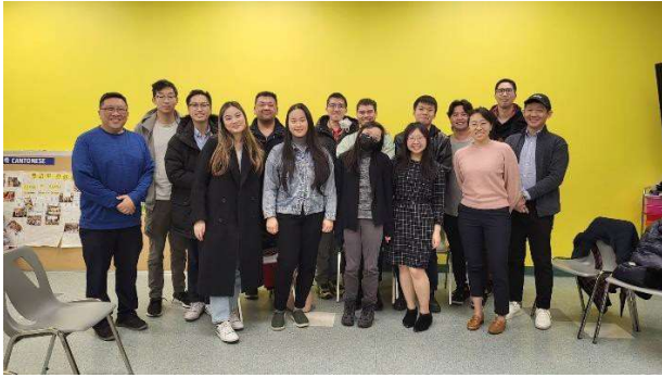
Last Cell Celebration/Send Off Event