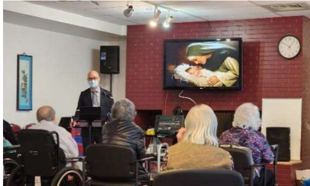
康寧耆老中心崇拜 Worship service at McNicoll Manor

“萬民哪、你們當稱頌我們的 神、使人得聽讚美他的聲音。他使我們的性命存活、也不叫我們的腳搖動。” 詩篇 66:8-9