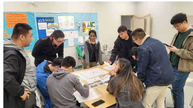
Mystery Boardgame Event