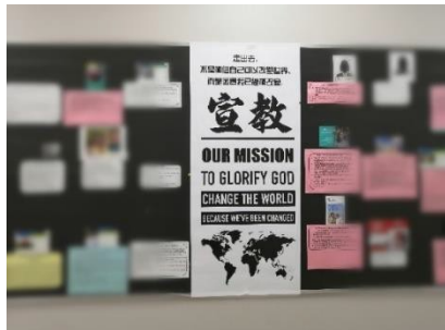
差傳佈告版 The Mission bulletin board

“願神憐憫我們、賜福與我們、用臉光照耀我們。好叫世界得知你的道路、萬國得知你的救恩。” 詩篇 67：1-2