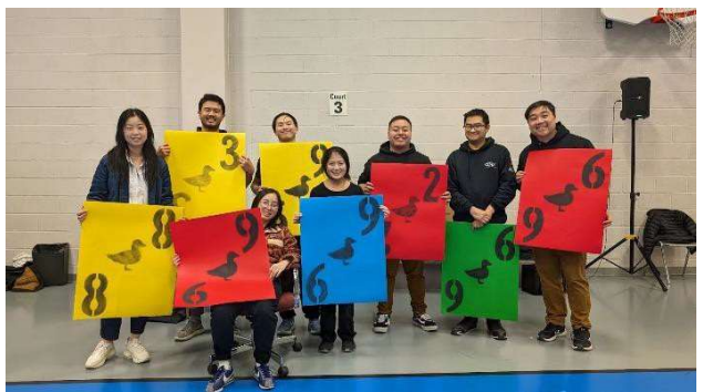
Student Zone Leadership