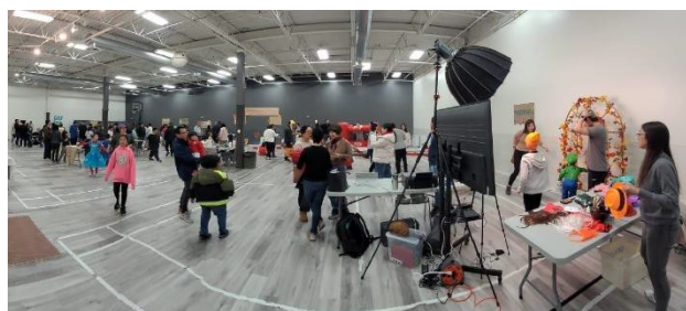
October 2023 – Harvest Carnival 豐收嘉年華會

這也是一段充滿親子互動的愉快時光，我們一起用餐，一起玩遊戲，不僅讓我們放鬆心情，還促進了親子關係。最後家長精心預備了禮物送給孩子，對孩子勉勵、祝福。聖潔身心退修營是個好的開始，當中的參考材料也為家長和孩子在以後的交流中提供了參考，相信神透過這次退修會對我們每個家庭都有祝福，推薦有青少年孩子的家長和孩子一起參加。