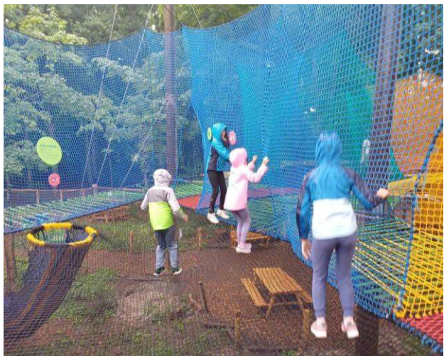
July 2023 - Outdoor Fun at Treetop Adventure Park 戶外同樂日