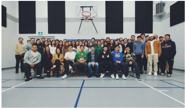
Volleyball Christmas Potluck 聖誕節排球隊聚餐