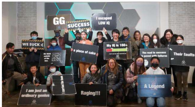
March 2023 – Passport to Purity Retreat for Cantonese Families 粵語家庭P2P 退修會

This testifies and shows how God is the King of Kings and Lord of Lords. This is my faith journey of God's purpose, plan, and faithfulness in my life in children's ministry. I am in awe each day as he continues to shepherd, trains, and molds me as a leader to serve His people from someone who barely knew Him in the beginning. He is the Alpha and Omega as He's been there at the start and will be until the end!