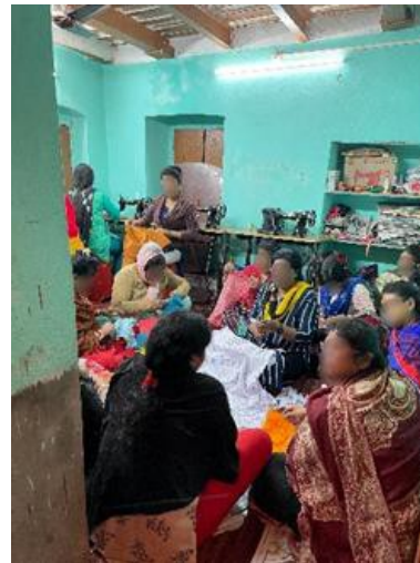
NIDA (Indian for “Voice”) Christian Ministry is serving women & children victims of slavery and prostitution in the red-light brothels of Kolkata.