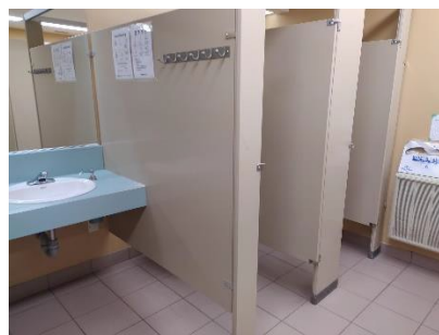
South washroom before renovation 南廁裝修前