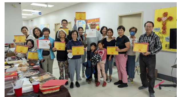
Volunteer Appreciation 感謝一眾義工