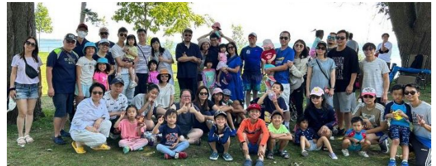
August 2023 – KLS Beach Day 陽光與海灘日

這證明神是萬王之王，萬主之主。這使我經歷到神在我兒童事工的旨意，計劃和生命中的信實的信心之旅。我每天都敬畏著祂，因為祂繼續的牧養和訓練我，並將我塑造為一個領導者，使我從一個最初幾乎不認識祂的人來事奉祂的子民。祂是阿拉法和俄梅戛，因為祂從開始直到末了都存在！