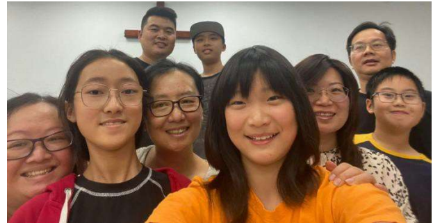
September 2023 – Passport to Purity Retreat for Mandarin Families

blessings God has given to our church, to seize every opportunity that allows them to establish relationship with God during our children's childhood and let them take root in the Lord as early as possible. May the Lord bless every family!