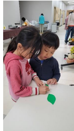
Children are helping too 兒童亦幫忙

我們為著陳黃月華感謝神，她多年來一直忠心地食物銀行中事奉並作領導，但她將於 2024 年離任，結束兩年的事奉任期，我們正在尋求神的指引來尋找另一位協調員。