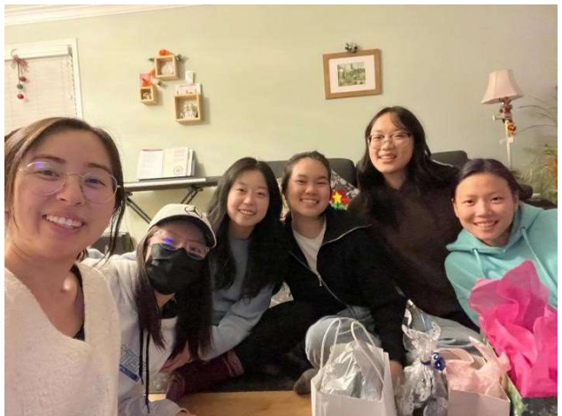
Rooted Discipleship Group Photos