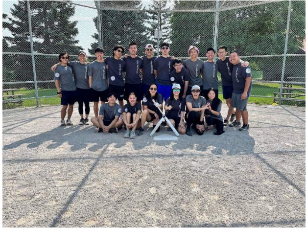
Team Unchained. 2023

In 2023, our congregation pursued evangelism in volleyball and softball. Volleyball ministry began partnering with a newly formed volleyball league (CCVL), with nine teams participating weekly on Saturday afternoons, attracting 60 to 80 attendees, the league intertwines sports and spirituality with team captains leading devotionals. It serves as a platform for outreach, bolstering attendance at GCGCNY and CGCS drop-ins, while auxiliary events such as online prayer meetings and special volleyball sessions have fostered community bonding. As of December 2023, the Discord server boasts over 425 users, with CCVL's inception contributing to its growth alongside an expanding core group. This year's adult softball team, Unchained, consists mainly of our university students from the previous year with a few experienced players joining. The team focused on sharpening on field skills while providing a space for seekers to fellowship with our community regularly throughout the week.