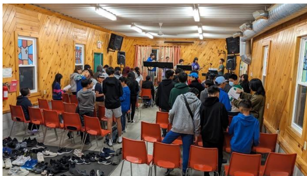
Genesis Retreat Main Session 創世紀青年團契退修會