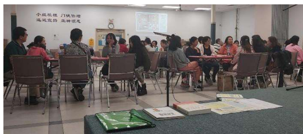
November 2023 – Positive Discipline Parenting Workshop for Mandarin Families 國語家庭正面管教工作坊