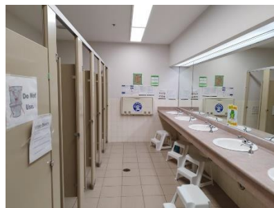
North washroom before renovation 北廁裝修前