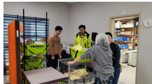
Food Bank Operation. 食物銀行的運作