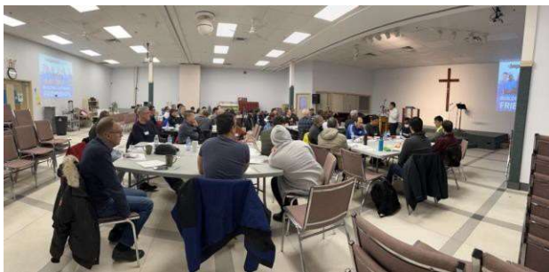
March 25, 2023 – Building Authentic Friendship Men's Workshop Our church hosted 50 men for a workshop on Building Authentic Friendships. We collaborated with churches from Stouffville, Markham, and Mississauga to enjoy breakfast, worship and a time of edification.