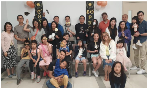
June 2023 - Positive Discipline Parenting Workshop for Cantonese Families 粵語家庭正面管教工作坊