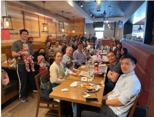
April 9, 2023 – Easter Swiss Chalet – Zone Lunch 復活節午餐於 Swiss Chalet