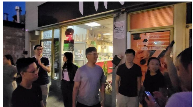
Cell Outing at Tinuno

Although we never got to multiply and only ever got larger with new faces every year due to the nature of the demographic, those who came for the first time always voiced that they felt welcomed and safe to be part of the community.