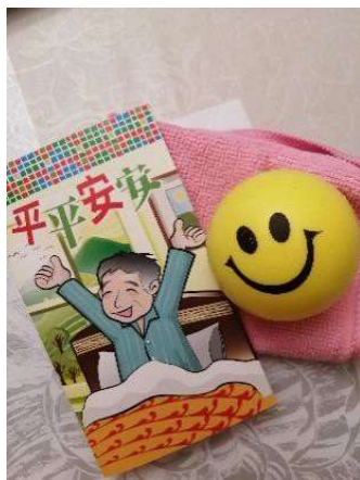
給康寧耆老中心的新住客的禮物 Gifts for new residents at McNicoll Manor

“Praise our God, O peoples, let the sound of his praise be heard; He has preserved our lives and kept our feet from slipping.” Psalm 66:8-9