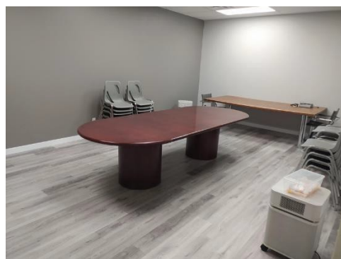
Conference room after renovation 會議室裝修後