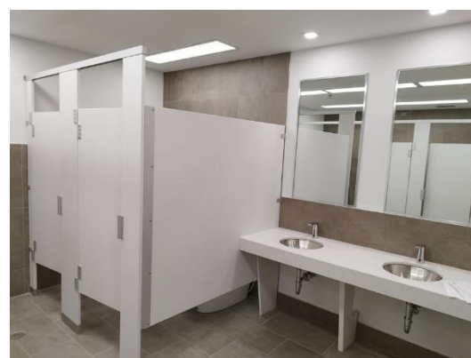
South washroom after renovation 南廁裝修後