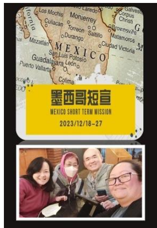
墨西哥短宣 Mexico short-term mission