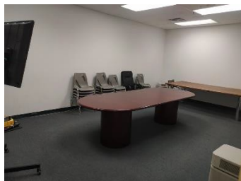
Conference room before renovation 會議室裝修

哥林多後書 9:8 “神能將各樣的恩惠，多多的加給你們，使你們凡事常常充足，能多行各樣善事”